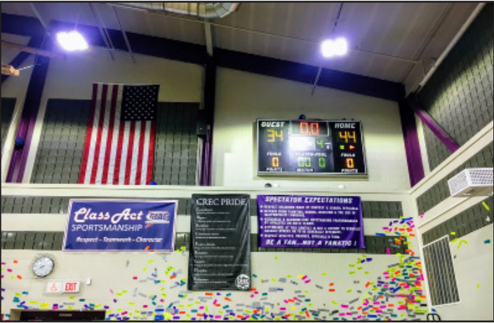
Score board showing final score of 34-44